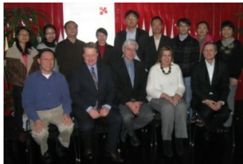
The crowd at the launch of the Chinese HD Network. Your humble author can be seen in the front row.

Not much is known about how much Huntington's disease there is in China. In general, researchers believe it's less common than in Europe and America. But given the large size of the Chinese population, even if incidence is relatively low, there may be a large number of HD-affected people living in China.