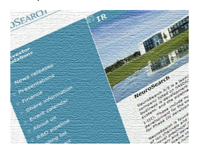
Neurosearch is a pharmaceutical company based in Denmark

Like MermaiHD, patients treated in the HART study ended up with movement scores that were better on average. Again, the study didn't show a significant improvement in voluntary functioning that had been hoped for - but that is not surprising since it was smaller and shorter. A dose-response relationship was found, which suggests that the drug is acting in the way we would expect.