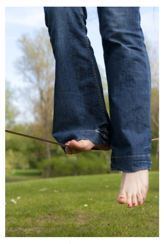
Problems with balance and coordination are currently very difficult to treat in HD

This imbalance is mirrored by two common patterns of movement problem that often exist at the same time in HD patients. The first is involuntary, extra movements called chorea. The second is a loss of voluntary movements, causing stiffness, poor coordination, balance problems and falls.